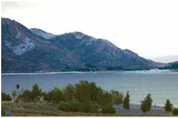
Rare snowfall on Bernasconi Hills

For thousands of years, the native California groups who lived here enjoyed the area's abundant resources and mild climate. Food, water, shelter, and clothing were plentiful. The native people hunted antelope, bighorn sheep, deer, rabbits, birds, and a variety of small mammals. Native seasonal houses